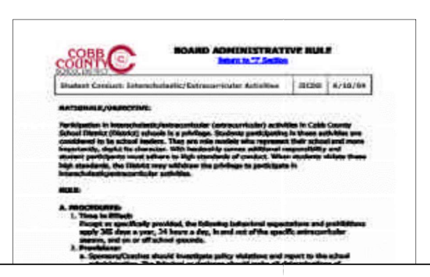
Sample – see www.Cobbk12.org for current version

This Cobb County policy must be observed by the Harrison Band. Log on to <a href="http://www.cobbk12.org/centraloffice/adminrules/I/IDFB-R.pdf">http://www.cobbk12.org/centraloffice/adminrules/I/IDFB-R.pdf</a> to review the policy in its entirety.